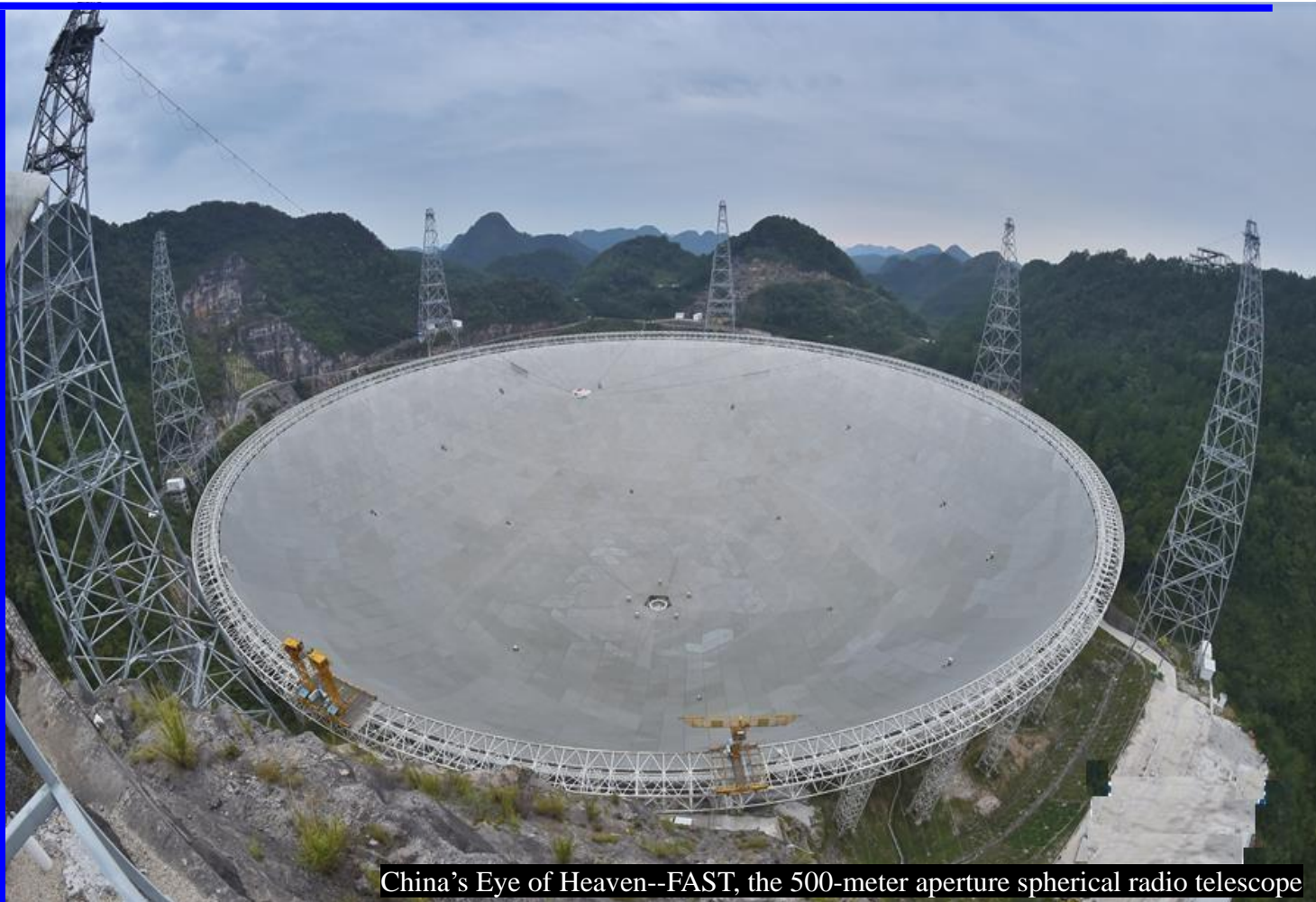
China's Eye of Heaven--FAST, the 500-meter aperture spherical radio telescope

--Achievements accomplished on the 70th anniversary of the founding of the People's Republic of China